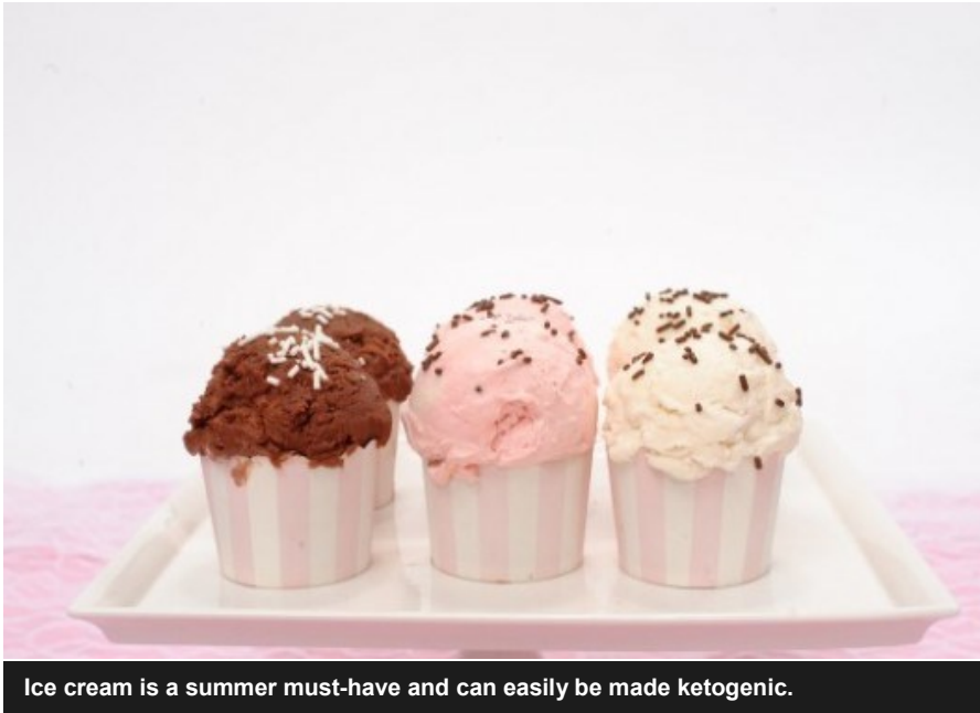
Ice cream is a summer must-have and can easily be made ketogenic.