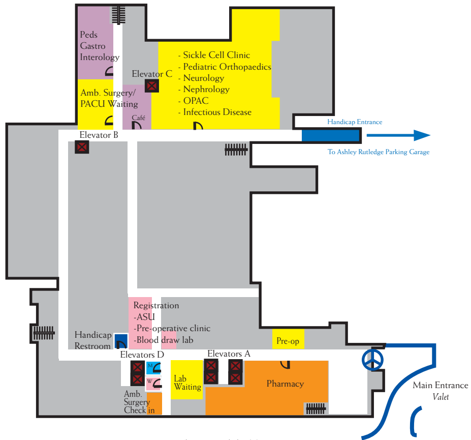
1st Floor – Rutledge Tower